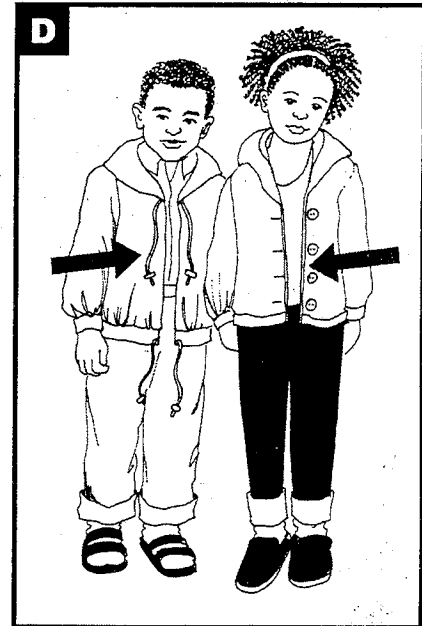
These drawstrings are too long. They have large toggles that are more likely to catch.